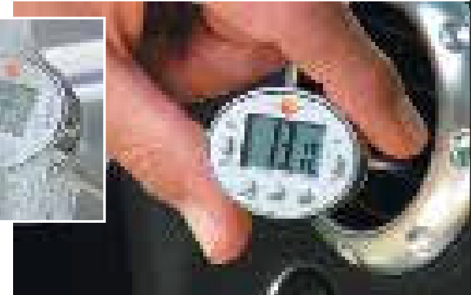
Measurements on air conditioning units