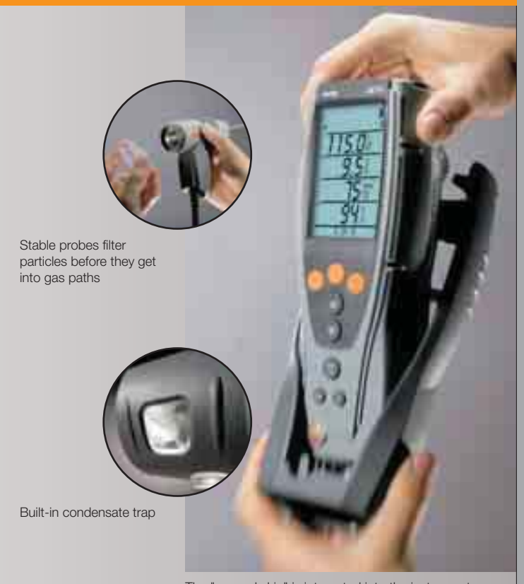
The "second skin" is integrated into the instrument design and protects from impact and shock during tough everyday use