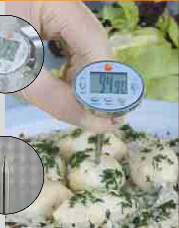
Spot checks during food distribution